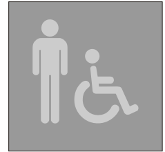
NOT ENOUGH CONTRAST