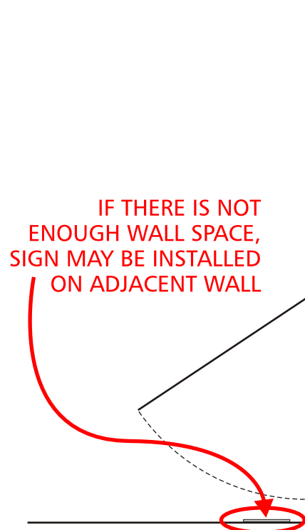
PLAN VIEW SCALE: 1/2" = 1'-0"