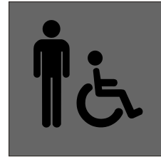
NOT ENOUGH CONTRAST